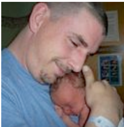
Bristol, trisomy 18, USA

Parents may be told that a baby diagnosed with trisomy 13 or trisomy 18 is incompatible with life or that the condition is 'lethal' (Koogler et al., 2003).